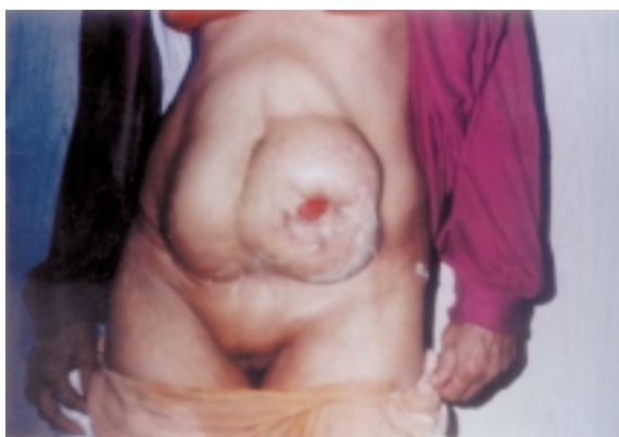
Fig. (4,A): Preoperative.