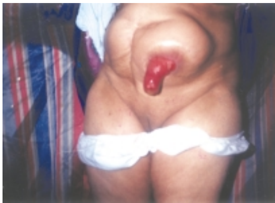
Fig. (3,A): Preoperative.