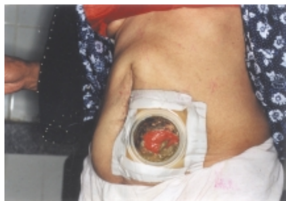
Fig. (4,B): Postoperative.