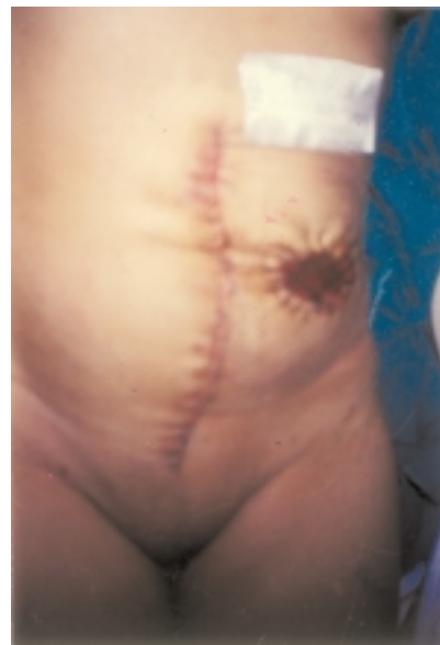
Fig. (3,B): Postoperative.