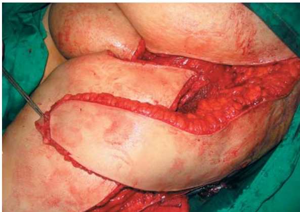
Fig. (3-B): Showing the defect resulting after wider excision of the scar and the flap being rotated.