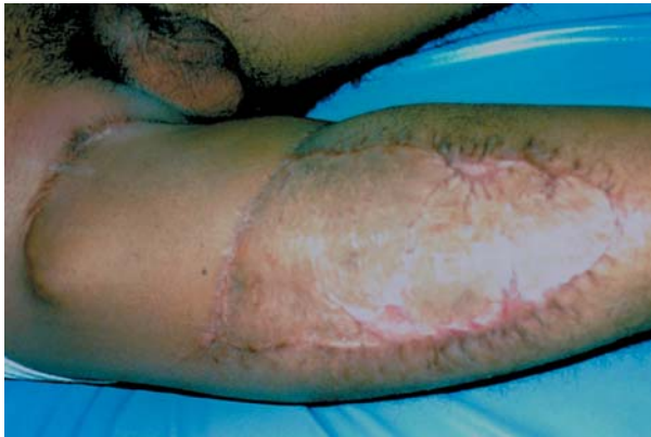
Fig. (2-C): Showing one year postoperative view of the TFL flap covering the groin defect. Note, the skin graft covering the donor site defect.