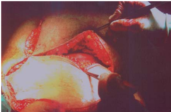
Fig. (1-C): Showing the flap being rotated over the defect. Note, the prolene mesh having been applied over the omentum before the flap.