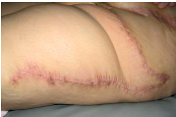
Fig. (3-D): Showing 8 months postoperative view of donor site scar healed by primary intention after primary closure.

As regards the donor site, all wounds were closed with a split skin graft apart from one case, which was closed primarily. There were