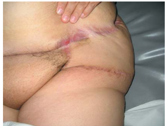
Fig. (3-C): Showing 8 months postoperative view of the flap settling well over the defect.