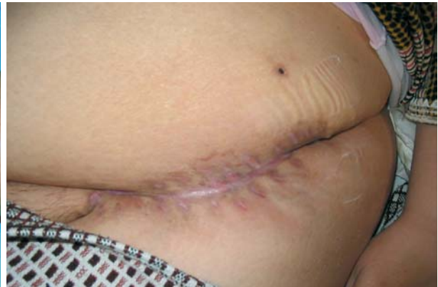
Fig. (3-A): [Case 5 (Table 1-B)], showing preoperative view of a scar resulting after incomplete removal of malignant fibrous histiocytoma of left groin.