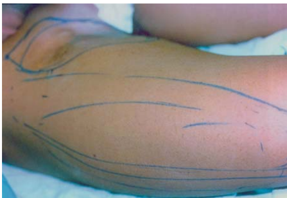
Fig. (2-A): [Case 3 (Table 1-B)], showing a preoperative view of recurrent peripheral neuroectodermal tumor of the right groin. Note, marking of the TFL flap on the thigh.