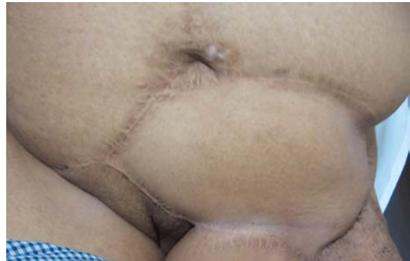
Fig. (1-D): Showing a 2-year postoperative view of the flap lying on top of prolene mesh covering the infraumbilical defect in Fig. (1-C). Note slight abdominal bulging at the flap site, and skin graft scar over the donor site.