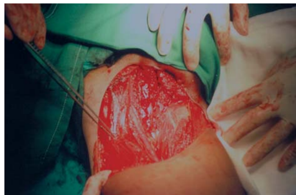
Fig. (2-B): Showing groin defect with exposed femoral vessels following tumor resection in Fig. (2-A).